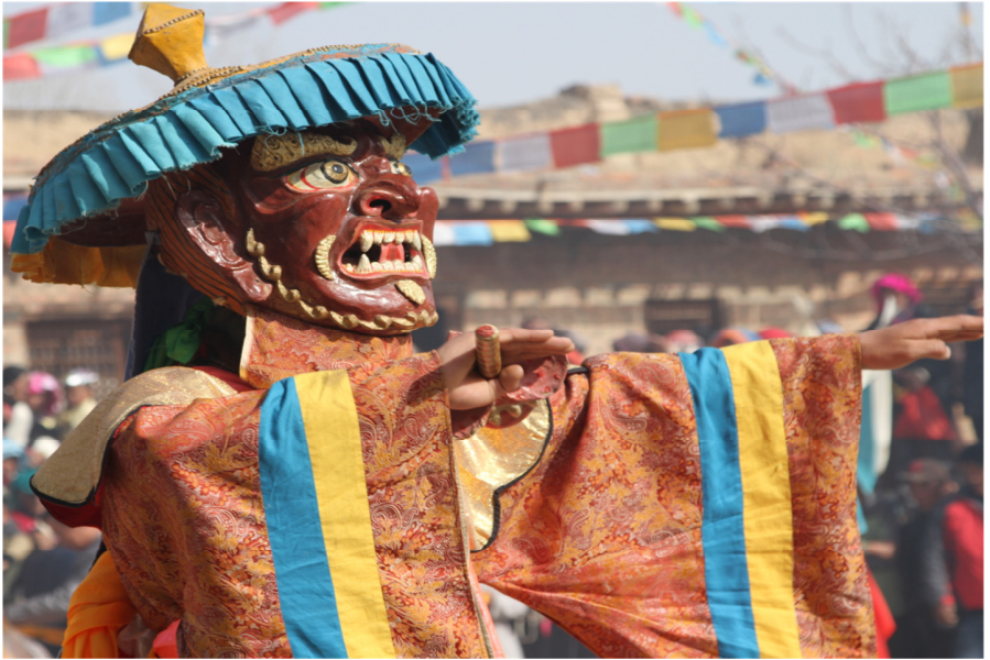
Dam can mgar dmar in the courtyard (Dpal rgyal gong ba'i sngags khang, Dpon rgya Village, 2013).