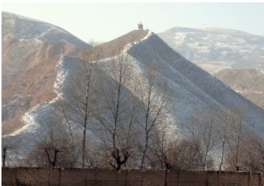
A myes Brag dmar Lab tse in winter. Dpon rgya villagers venerate Brag dmar Deity (2012).