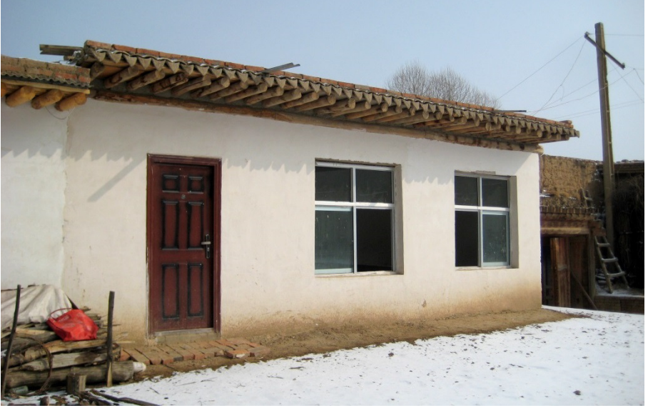
Mtshams khang for sngags pa (Dpal rgyal gong ba'i sngags khang, Dpon rgya Village, 2013).