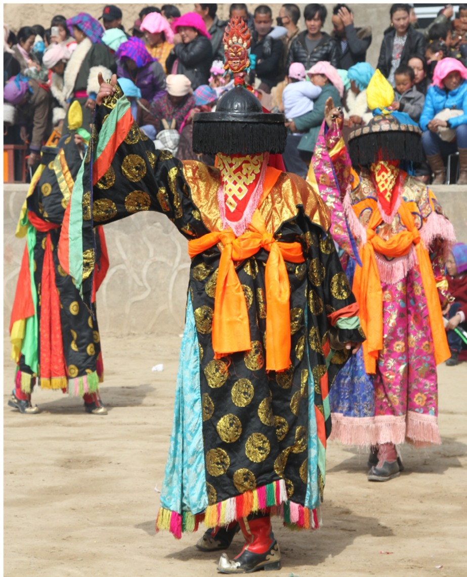
Zhwa nag performers dance in the courtyard (Se rtsa'i sngags khang, Se rtsa Village, 2013).