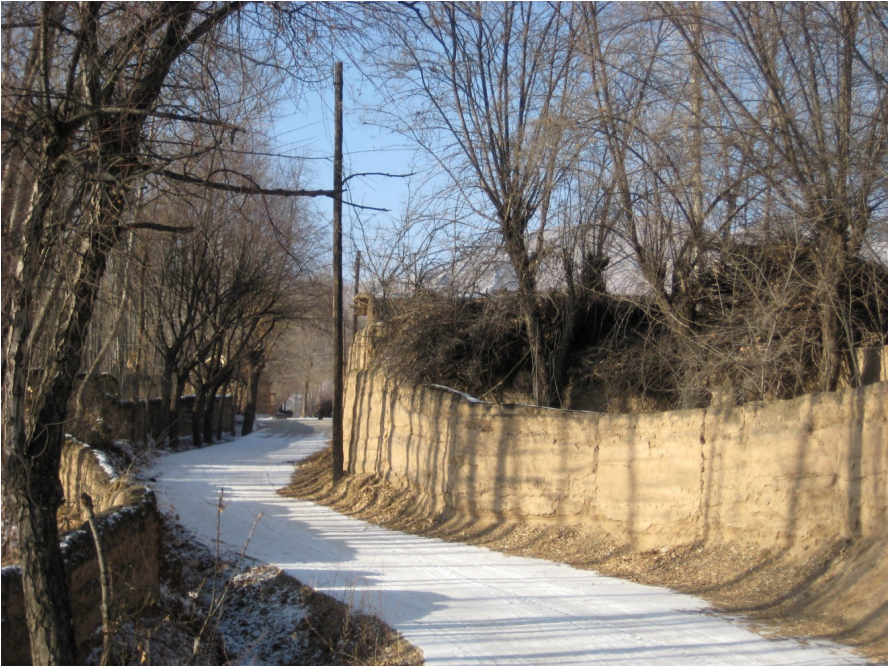
Concrete road in Rta rgyugs Village (2012).