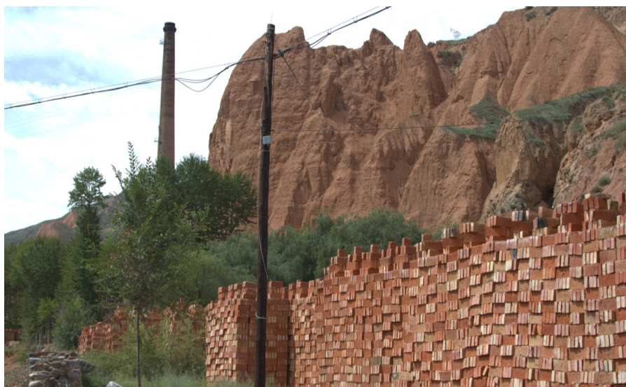
A kiln near Cung smad Village (2012).

Red bricks were first used in the village in the mid-1990s as flooring and then later in wall construction. In 2012, there was a kiln near Cung smad Village, about five kilometers from Rta rgyugs Village, where villagers paid 0.04 RMB per brick.