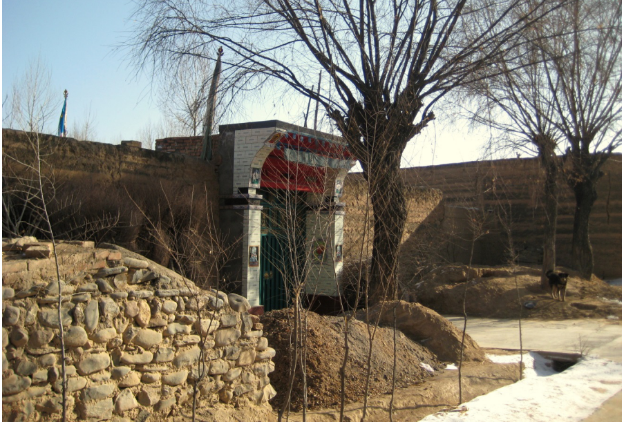
A village household entrance and a pig sty built with stone and earth (left). The family's dog is under a tree to the right (Rta rgyugs Village, 2012).

Every Tibetan household has an altar in the family courtyard center where bsang is offered early every morning to beseech protection from mountain, territorial, and protector deities, and where tsha gsur 26 is burned to beings in the ' gro ba rigs drug 'the six realms of sentient beings'. 27