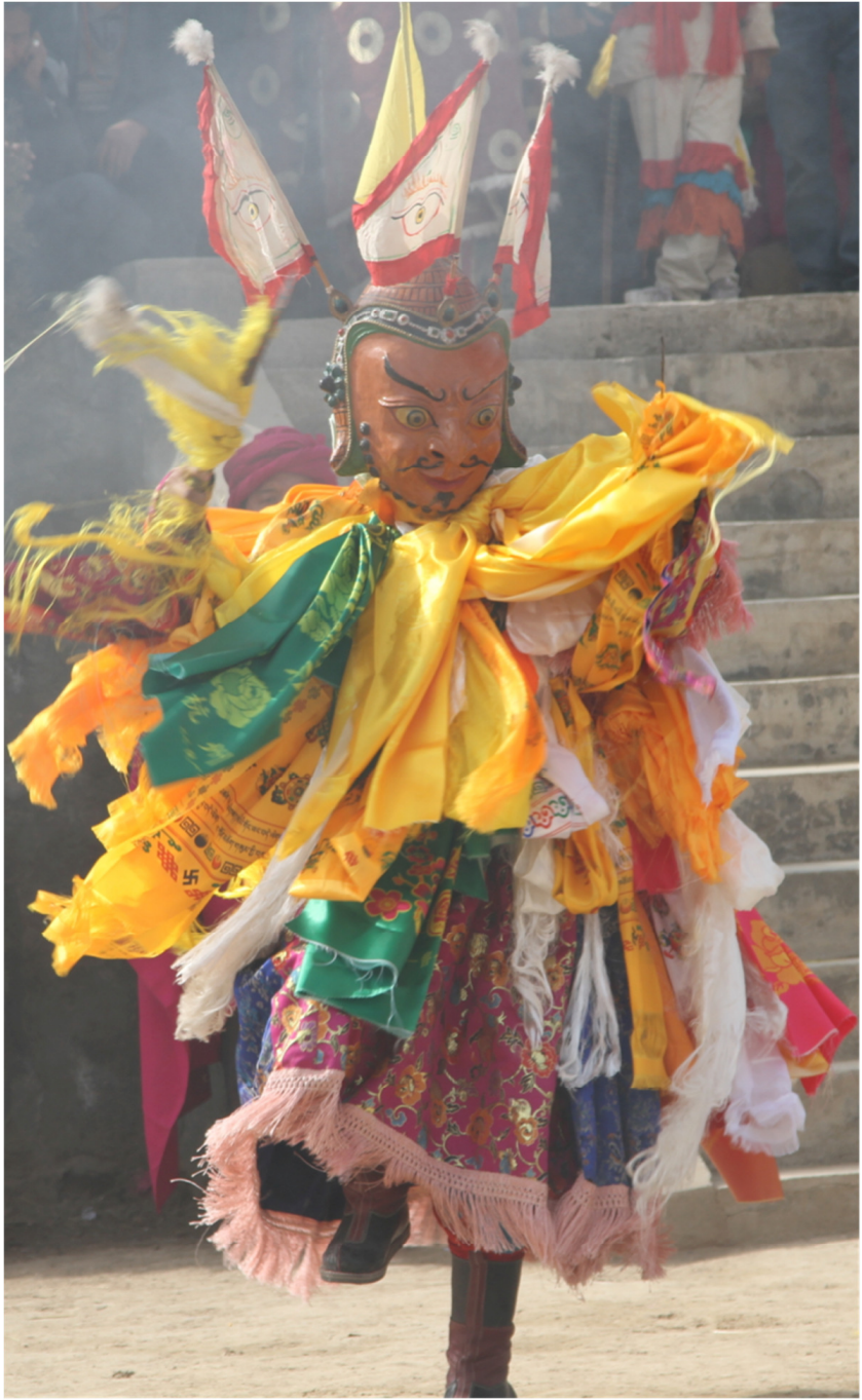
Khams ri in the courtyard (Se rtsa'i sngags khang, Se rtsa Village (2013).