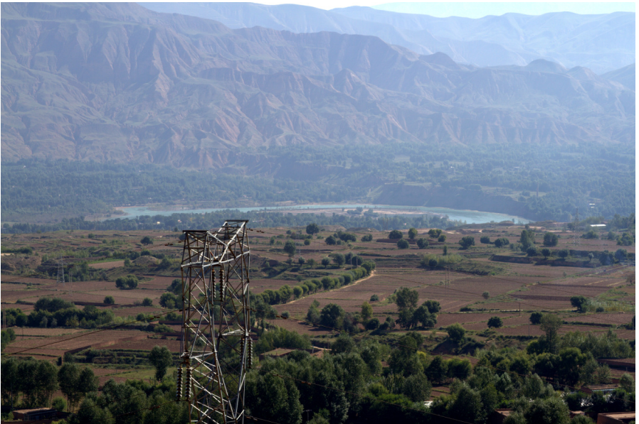
Rka phug Village. The Yellow River is in the background (2012).