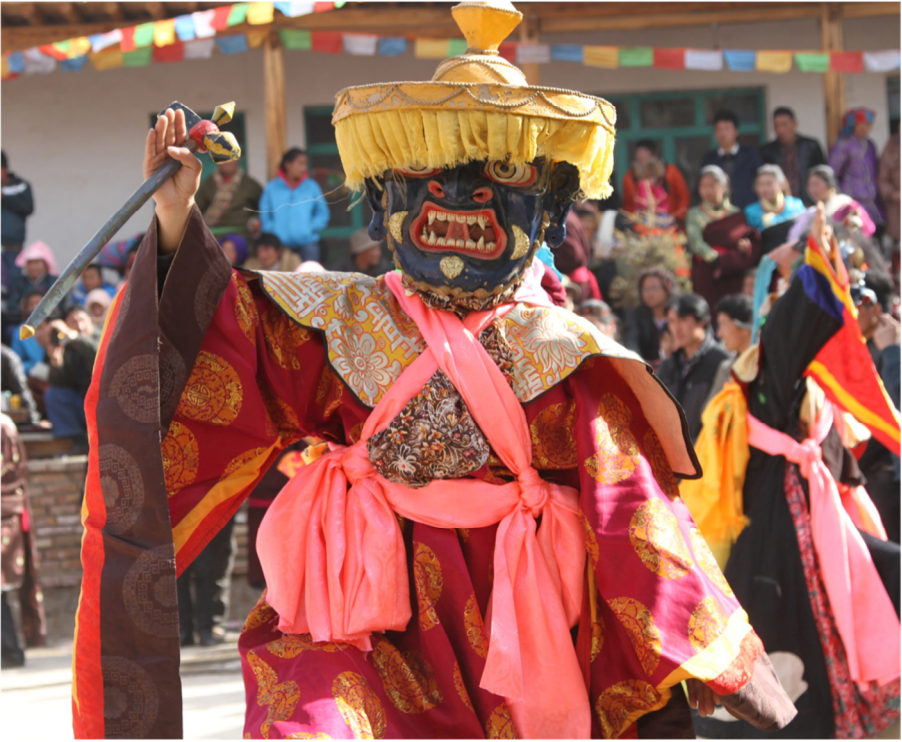
Dam can mgar nag in the courtyard (Dpal rgyal gong ba'i sngags khang, Dpon rgya Village, 2013).