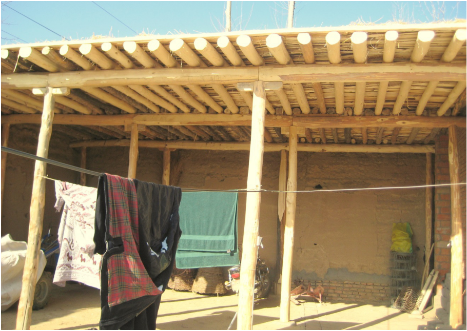
A village household storage area (Rta rgyugs Village, 2012).