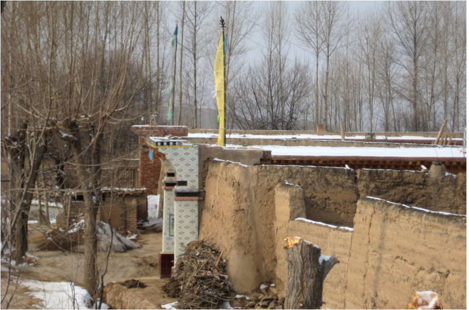
A village household gate and orchard walls (Rta rgyugs Village, 2012).