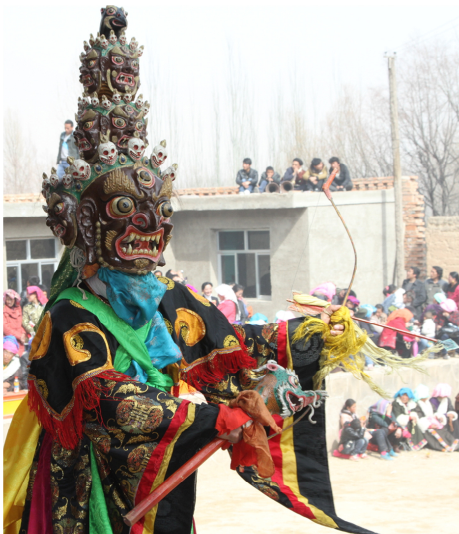
Gza' appears in the courtyard (Se rtsa'i sngags khang, Se rtsa Village, 2013).