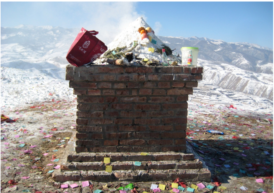
Khams ri Lab tse altar (2012).