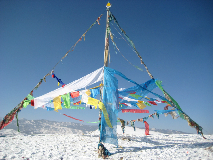
Wind flag printed with Tibetan scriptures atop a mountain by Srin po Lab tse (2012).