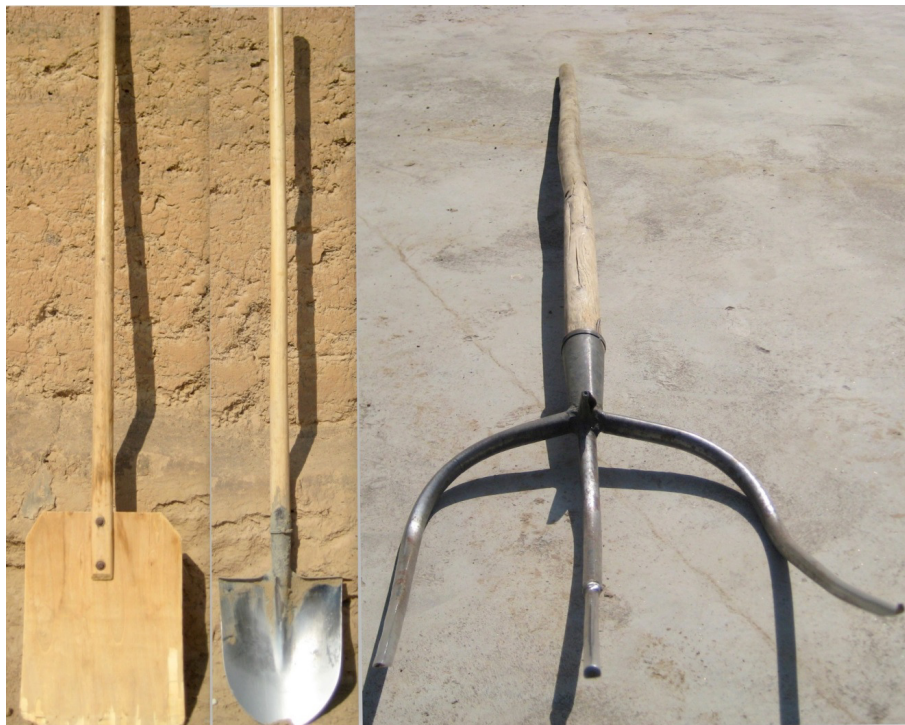
Farming tools (left to right): khem , lcags khem , and tsheb (Rta rgyugs Village, 2012).