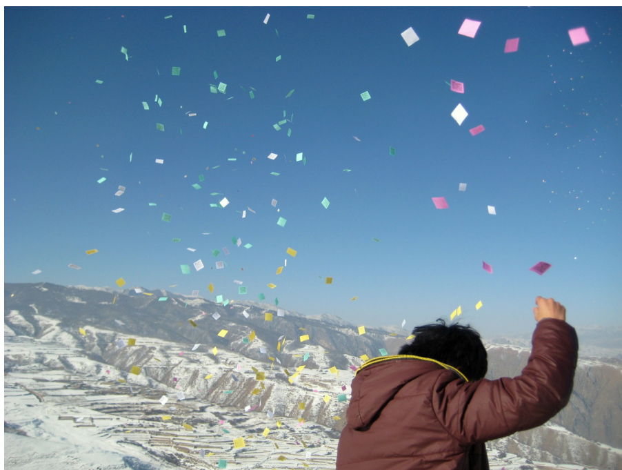
Rlung rta offered while circumambulating Khams ri Lab tse (2012).