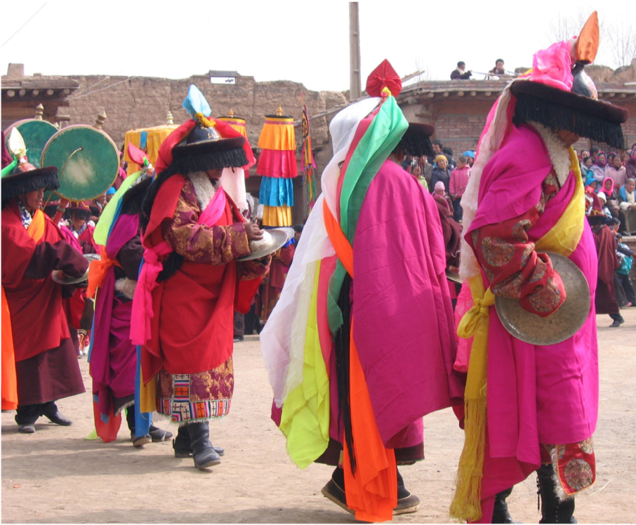
Sngags pa with sbug chal and drums circle the courtyard (Dpal rgyal gong ba'i sngags khang, Dpon rgya Village, 2013).