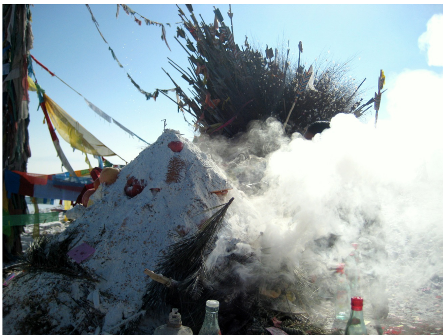
Bsang offered to Khams ri Deity (2012).