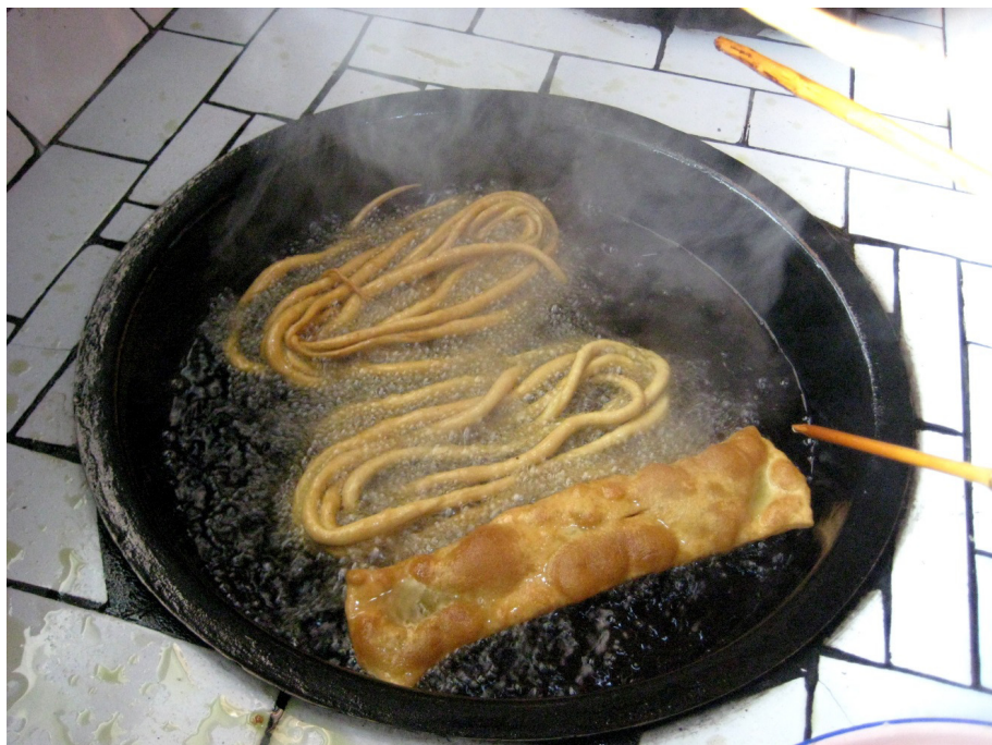
Sog sog (top) and gor dmar (bottom) – deep fried bread (Rta rgyugs Village, 2012).