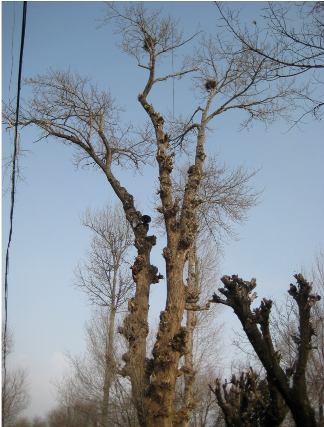
A 200 year old tree that is a symbol of Dpon rgya Village (2012).