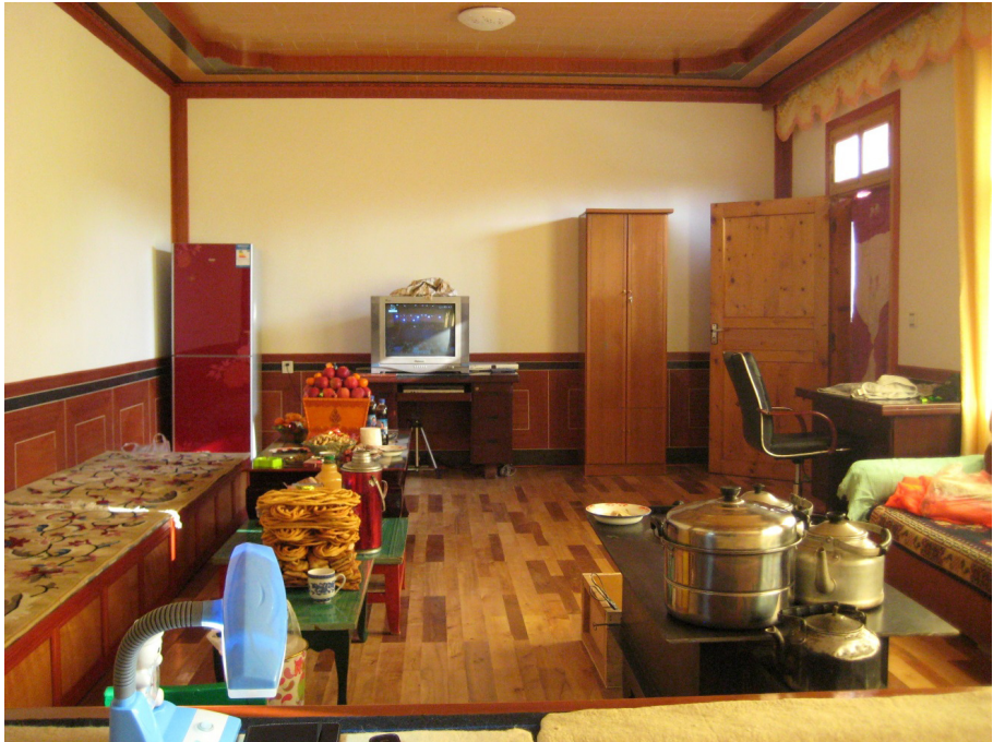
The interior of a modern village house (Rta rgyugs Village, 2012).