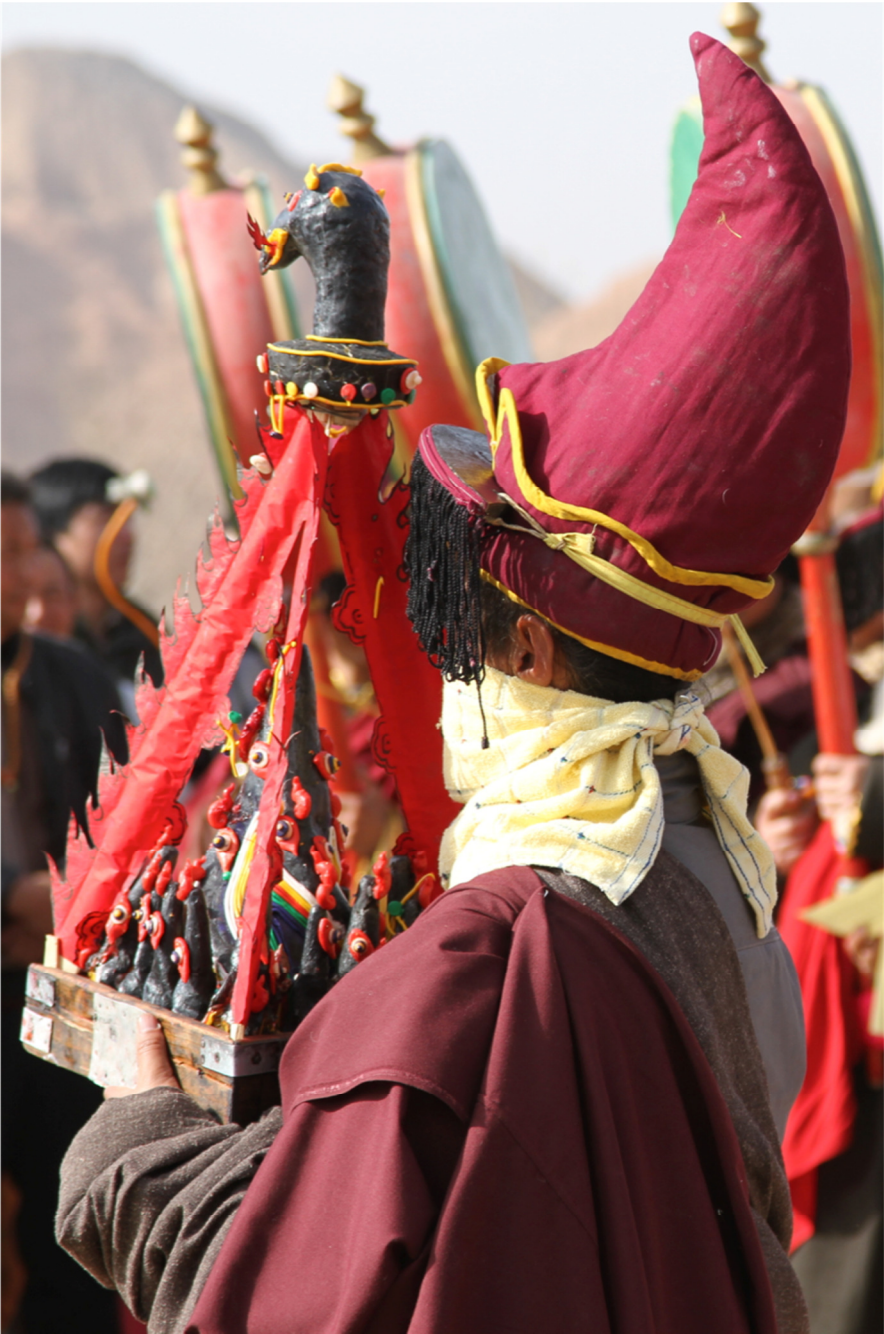
A sngags pa prepares to throw the gtor ma into a fire (Dpal rgyal gong ba'i sngags khang, Dpon rgya Village, 2013).