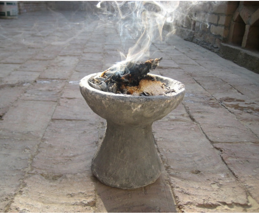
Newly boiled tea is offered to the tsha gsur in the morning (Rta rgyugs Village, 2012).

Nearly every household has a shrine in their home 25 where images of Shakyamuni, Padmasambhava, White Tara, Blue Tara, the tenth PaN chen bla ma (1938-1989), and locally famous bla ma such as Rka phug pandita and Rdzong nang Zhabs drung Dge 'dun Bstan pa rgya mtsho (1904-1993; Bsod nams tshe ring 2008:92-94) are displayed. Seven or fourteen copper containers of water are set before these images every morning and emptied in the afternoon. Fresh, pure water is added every morning. Rapeseed oil lamps are offered on the first and fifteenth days of every lunar month.