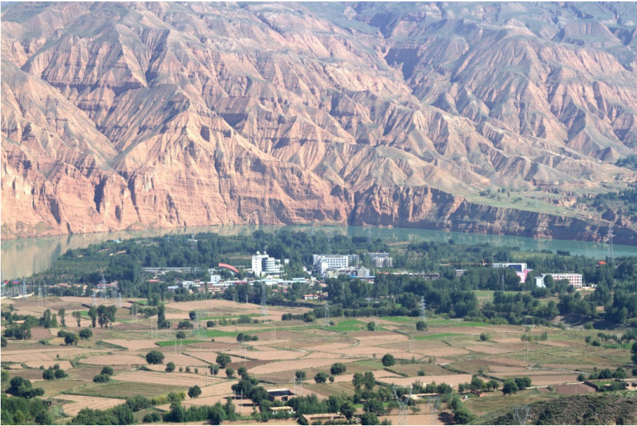
Khams ra Town on the banks of the Yellow River (2012).