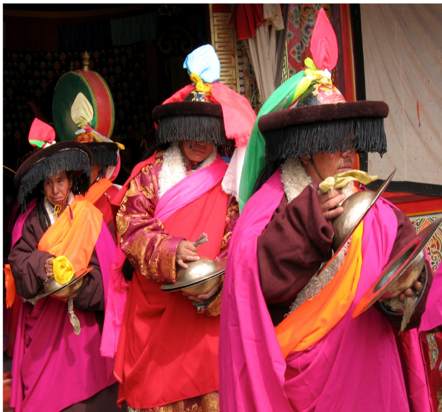
Sngags pa with sbug chal walk to the courtyard (Dpal rgyal gong ba'i sngags khang, Dpon rgya Village, 2013).