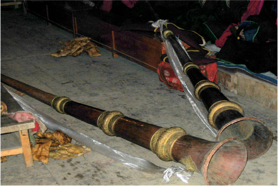
Dung chen inside Dpal rgyal gong ba'i sngags khang (Dpon rgya Village, 2013).