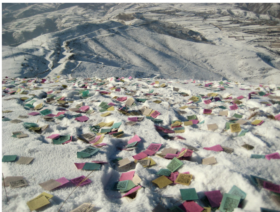
Rlung rta at Khams ri Lab tse (2012).