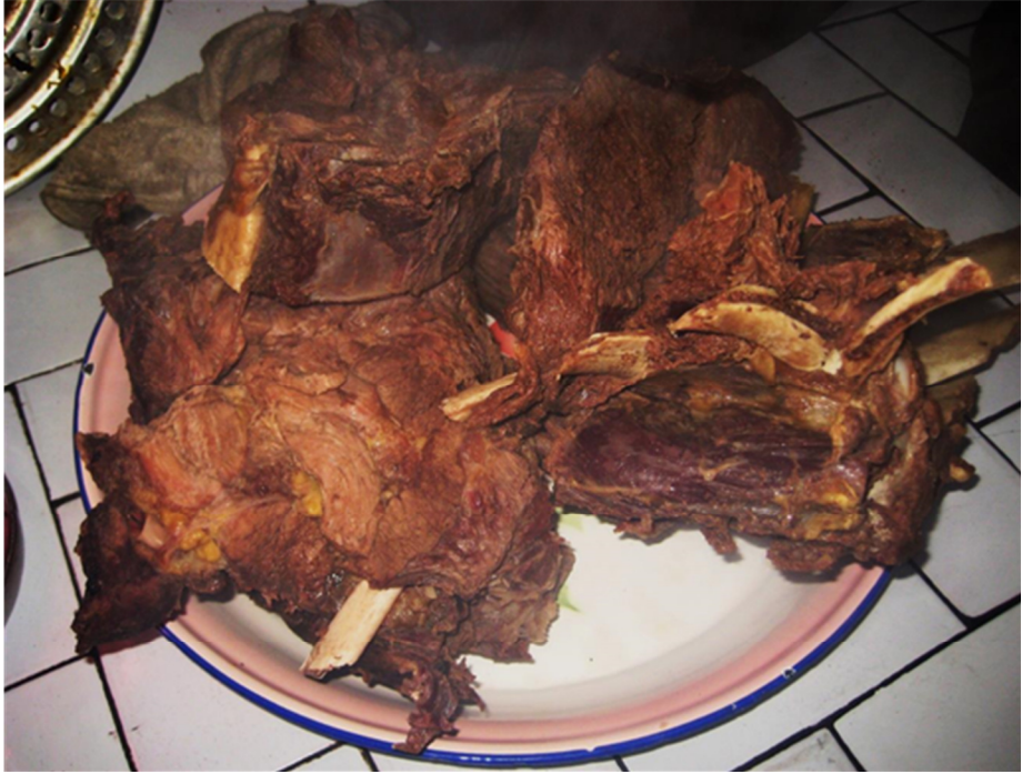
Boiled yak meat for Lo sar (Rta rgyugs Village, 2012).