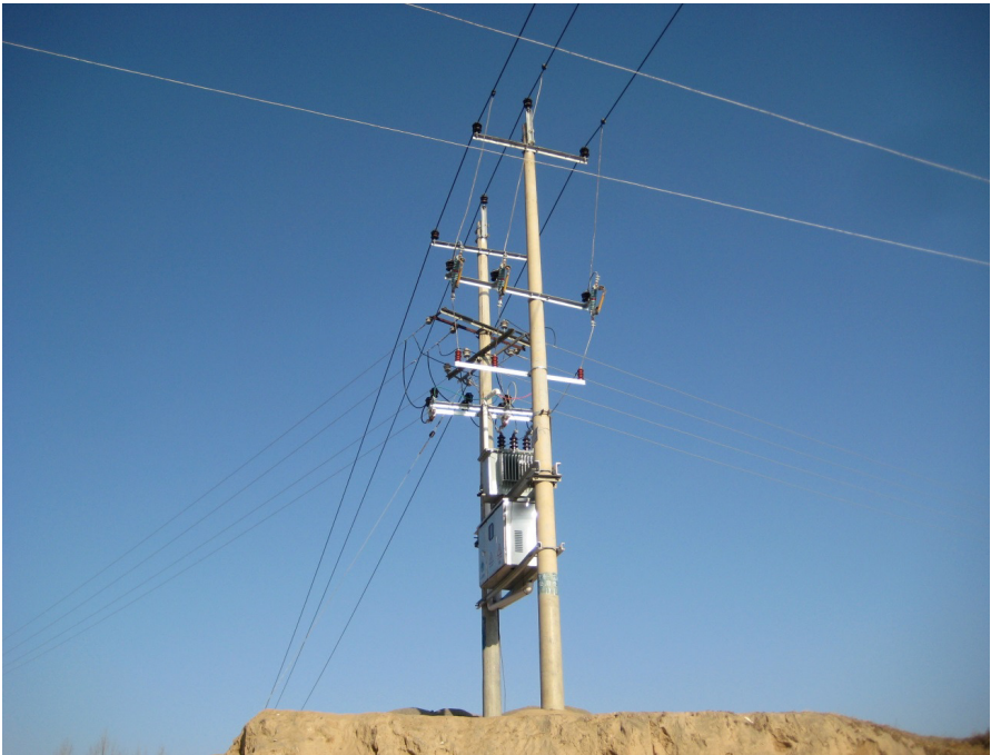
Electricity poles in Rta rgyugs Village (2012).