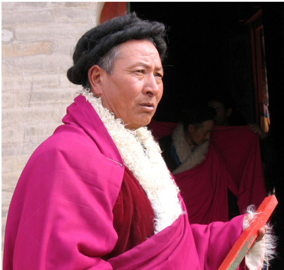
The dge skos holds a stick on 'Cham day (Dpal rgyal gong ba'i sngags khang, Dpon rgya Village, 2013).

mixture. The masks are put in bright sunshine to dry and might also be placed near the hearth in a monastery, where they are made. When the glue dries, the clay mold is removed. The resulting masks are then decorated and painted with their characteristic shapes and colors. The masks for the two villages are listed in Table 3.