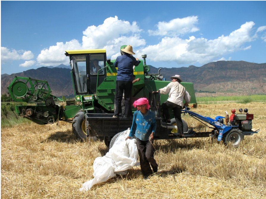
Villagers move grain from the combine harvester to a trailer (Rta rgyugs Village, 2009).