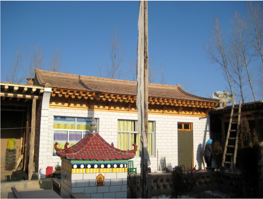
Contemporary village house, family wind flag, and a 'bum khang (center) in a courtyard (Rta rgyugs Village, 2012).