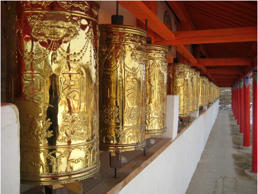
Prayer wheels in Dpal rgyal gong ba'i sngags khang (Dpon rgya Village, 2012).

Before seeking help from a bla ma or a sngags pa , villagers try to deal with a ghost by using a stout string to bind the afflicted person's thumbs together, which compels the ghost to reply to questions. Villagers order the ghost to leave immediately. Villagers may also hold the possessed person and beat their head with a burning broom to expel the ghost. Another treatment involves pressing the possessed person's ya mchu bar ma'i ngag lam 'philtrum' to expel the ghost. When ghosts are too strong for such measures, local villagers invite well-known sngags pa to expel them.