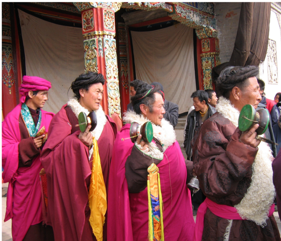
Sngags pa with Da ru walk to the courtyard (Dpal rgyal gong ba'i sngags khang, Dpon rgya Village, 2013).