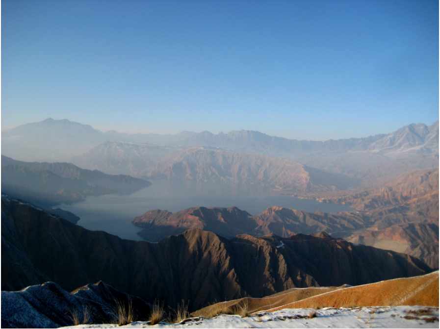
Sngo rgya Reservoir (Lijia xia), thirty kilometers from Khams ra Town (2012).