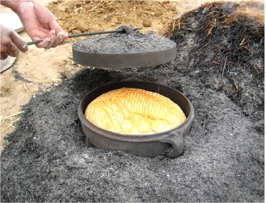
Gor mo zhi - bread baked in ash (Rta rgyugs Village, 2011).