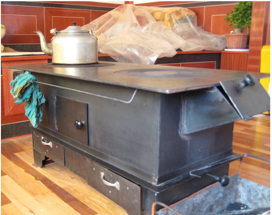
A modern stove in a new village house (Rta rgyugs Village, 2012).