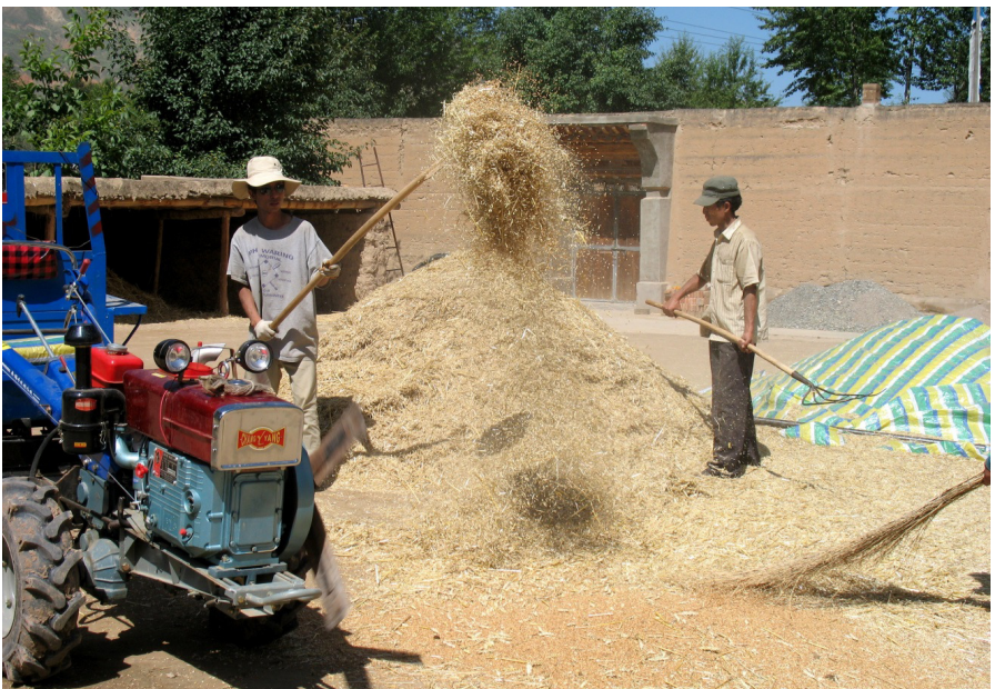
Separating straw from grain (Rta rgyugs Village, 2009).