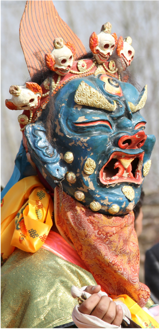
Dmag zor rgyal mo at the gtor rgyag (Dpal rgyal gong ba'i sngags khang, Dpon rgya Village, 2013).