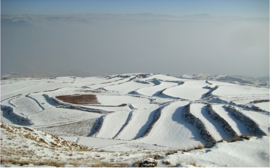
Se rgya and Thang mtsher fields in winter (2012).