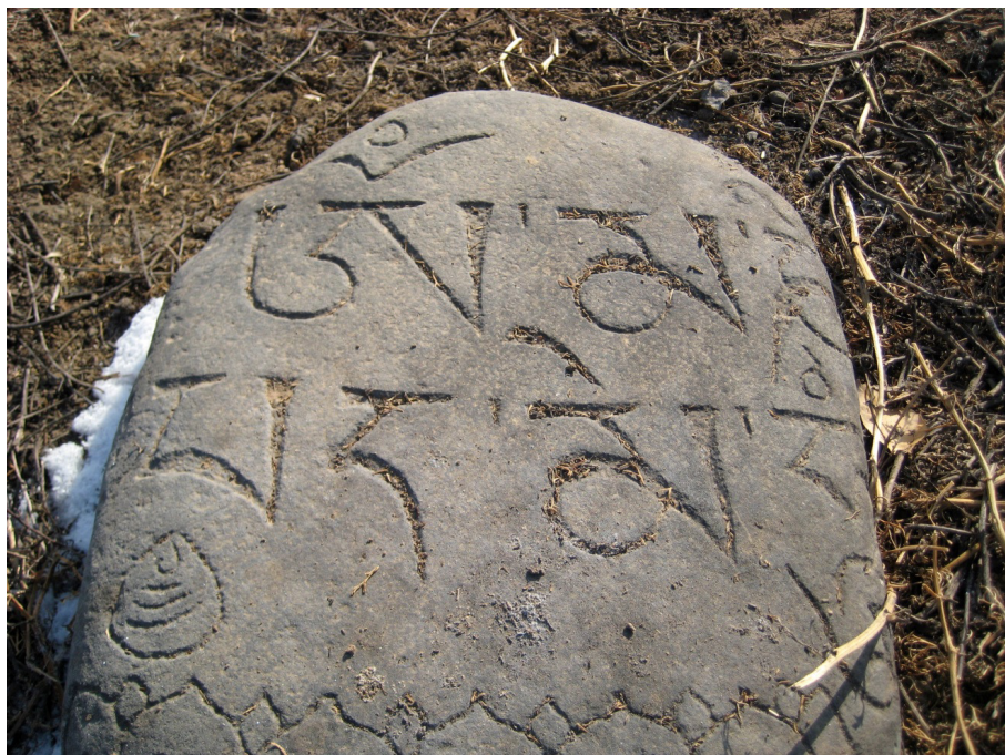
The Six Sacred Syllables on a stone near Cung smad Village (2012).