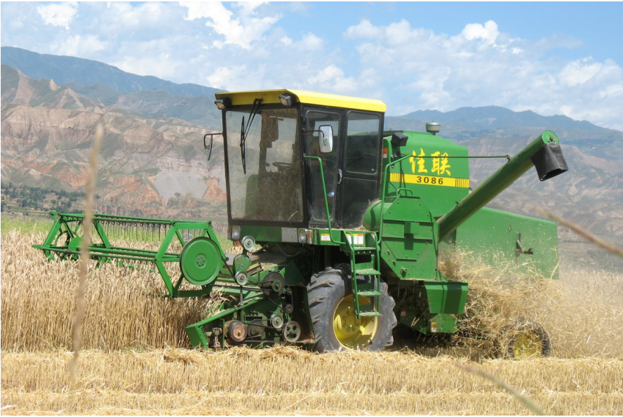
A combine harvester harvests village fields (Rta rgyugs Village, 2009).