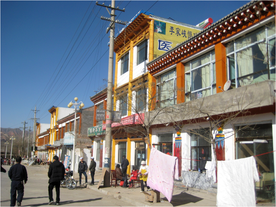
Khams ra Town is famous for its geographic features. Since 2011, local government has been reconstructing stores, houses, and roads to boost tourism (2012).