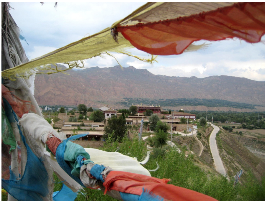
Rdzong nang Monastery, Rka phug Administrative Village (2010).

Sngags pa , known as dpon locally, are tantric specialists belonging to the Rnying ma Sect. They are believed to have the power to conquer ghosts and are invited to chant scriptures when family elders and women have bad dreams.