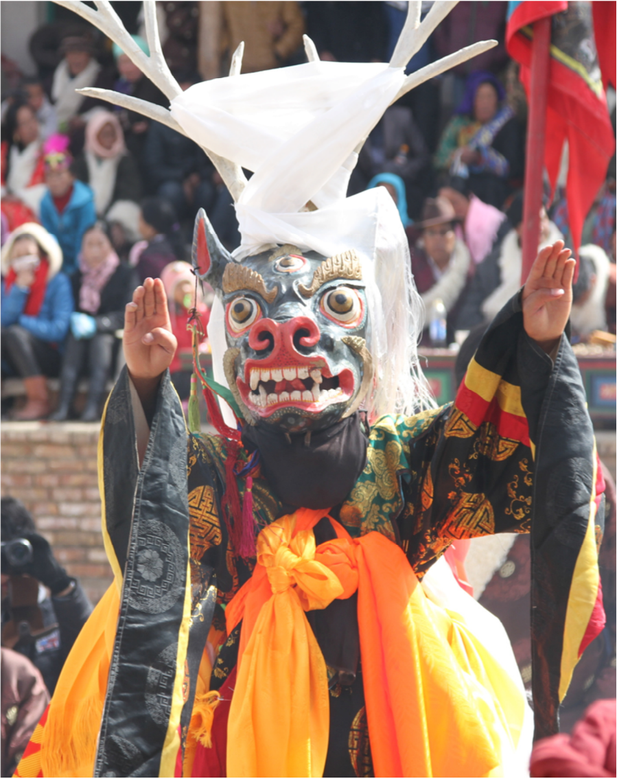
Shwa with kha btags (Dpal rgyal gong ba'i sngags khang, Dpon rgya Village, 2013).