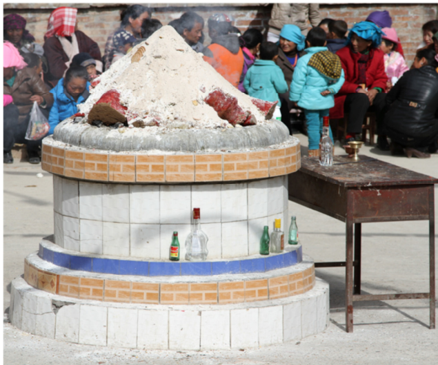
Incense offering in the courtyard center (Dpal rgyal gong ba'i sngags khang, Dpon rgya Village, 2013).

A large amount of bsang is offered in the dance courtyard center on the eleventh day and kept burning for seven days. Thousands of gtor ma 'dough effigies' are made by sngags pa and placed before deity images in the monastery during these days. 'Cham begins in the monastery on the twelfth day. There is no audience.