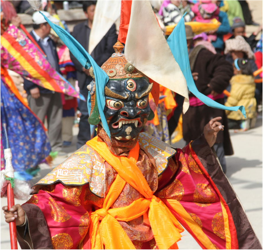
Bdud appears in the courtyard (Dpal rgyal gong ba'i sngags khang, Dpon rgya Village, 2013).