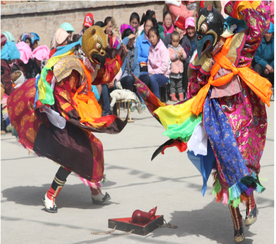
'Ug pa and pho rog attempt to dismember the nya bo (Dpal rgyal gong ba'i sngags khang, Dpon rgya Village, 2013).