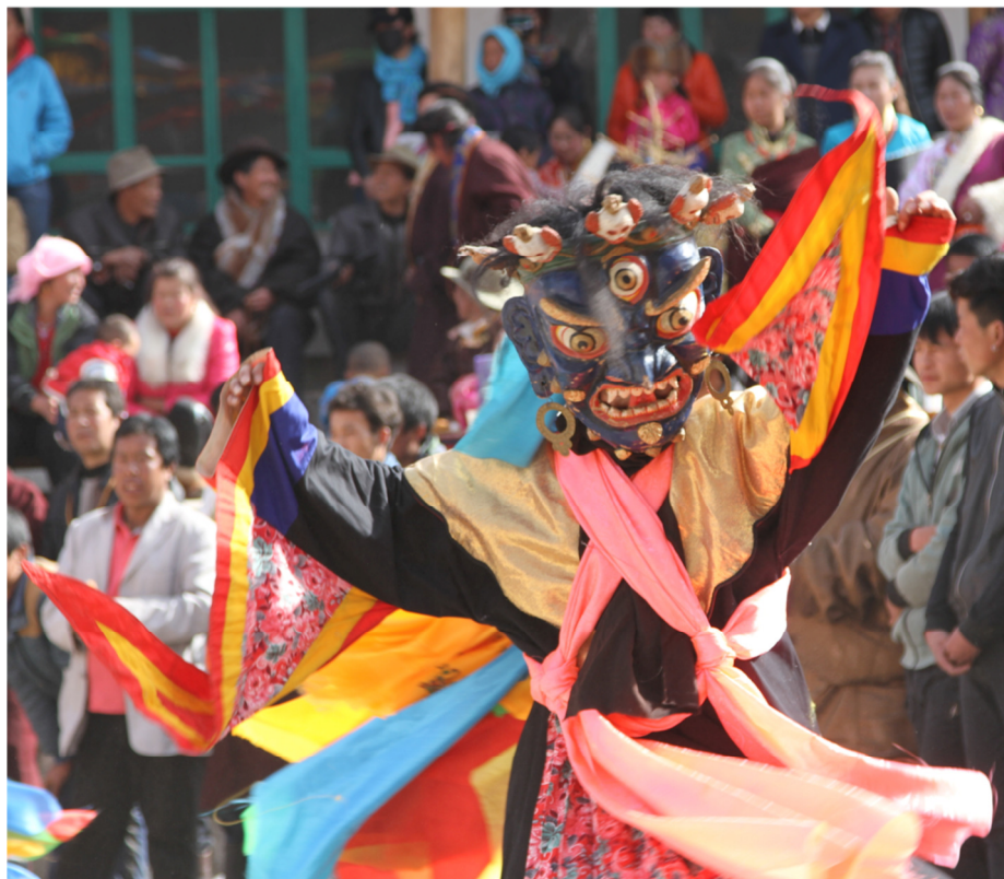
Khro bo dances in the courtyard (Dpal rgyal gong ba'i sngags khang, Dpon rgya Village, 2013).