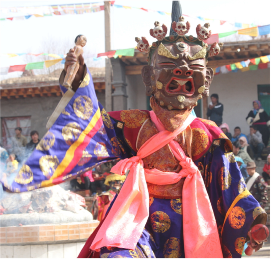
Sngags srung dances in the courtyard (Dpal rgyal gong ba'i sngags khang, Dpon rgya Village, 2013).