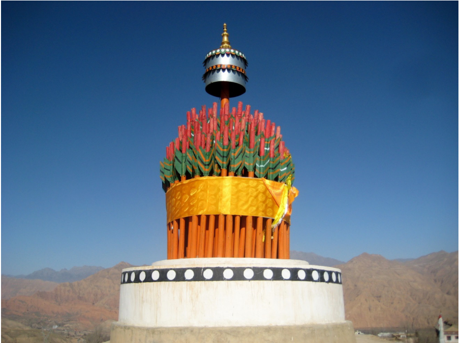
Cung smad Village Lab tse was renewed in 2011 by inserting poles resembling arrows and wrapping new cloth around the poles (2012).