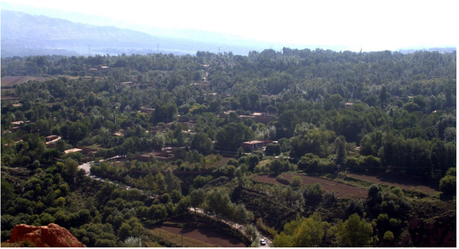
Rka phug Village. The Yellow River is in the background (2012).