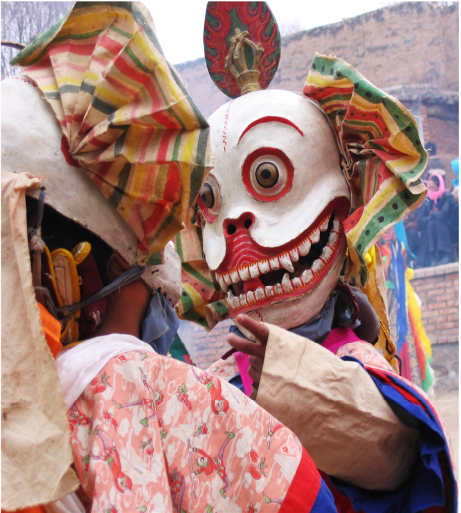
Keng rus in the courtyard (Dpal rgyal gong ba'i sngags khang, Dpon rgya Village, 2013).