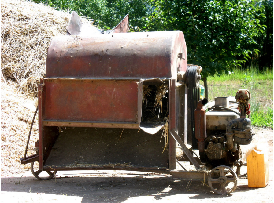
Tuoguji used to separate straw from grain prior to the time of combine harvesters (Rta rgyugs Village, 2009).