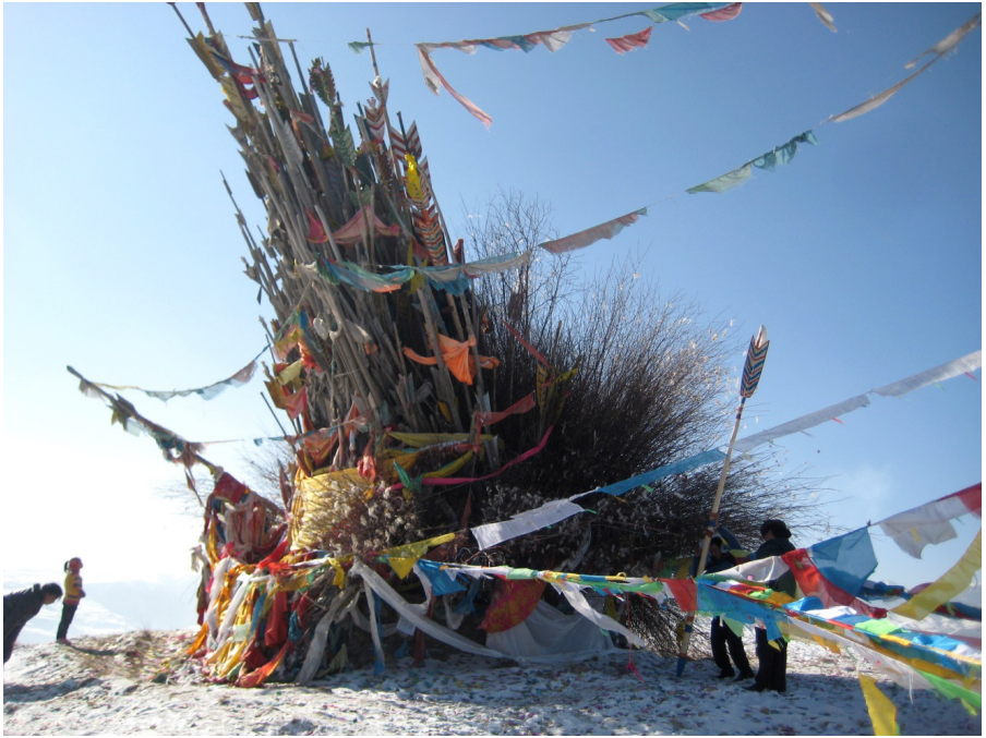
Khams ri Lab tse. Se rgya, Thang mtsher, Sngo rgya, Lha sde, and Se rtsa villages renew Khams ri Lab tse by adding poles resembling arrows and inserting bushes decorated with sheep's wool annually on the third day or the sixth day of the first lunar month (2012).