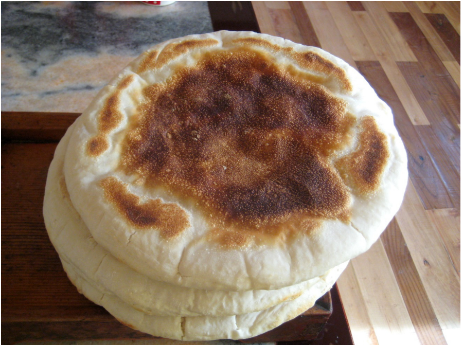
Zangs gor - baked bread (Rta rgyugs Village, 2012).