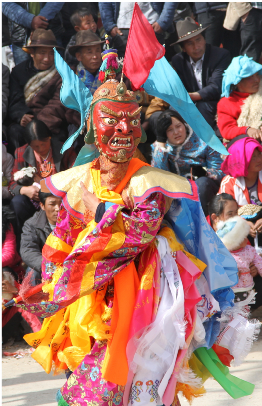
Brag dmar in the courtyard (Dpal rgyal gong ba'i sngags khang, Dpon rgya Village, 2013).