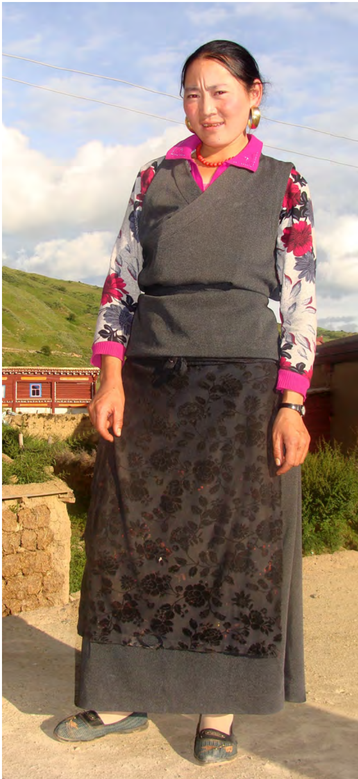
Aunt Sgrol ma in Nor 'ur Village (August 2011, Tshes bcu lha mo).