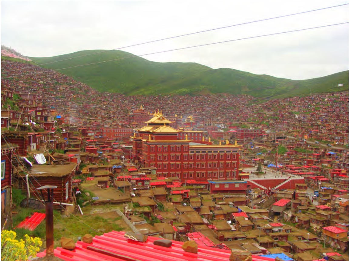
Gser rta bla rung Monastery, Gser rta County (August 2011,).

The sun had finally broken through the morning mist. The sky was blue and the earth was green everywhere. I could hear the sound of the river at the foot of the hill, and birds chirping in the distance. I took off my coat and lay on the grass. My bottom still hurt, but I didn't tell Grandfather. He soon finished cooking, and we enjoyed a nice meal. Our day on the hill was enjoyable and memorable.