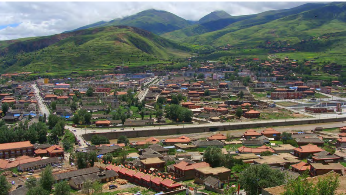
Brag 'go County Town (August 2011,).

We enjoyed the pork, but I also really missed my pig.