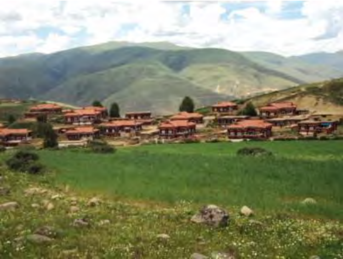
Nor bu khug Village (June 2013, Dbang mo).

I thought constantly about those two lucky boys during the entire summer vacation, and longed to have the same karma.