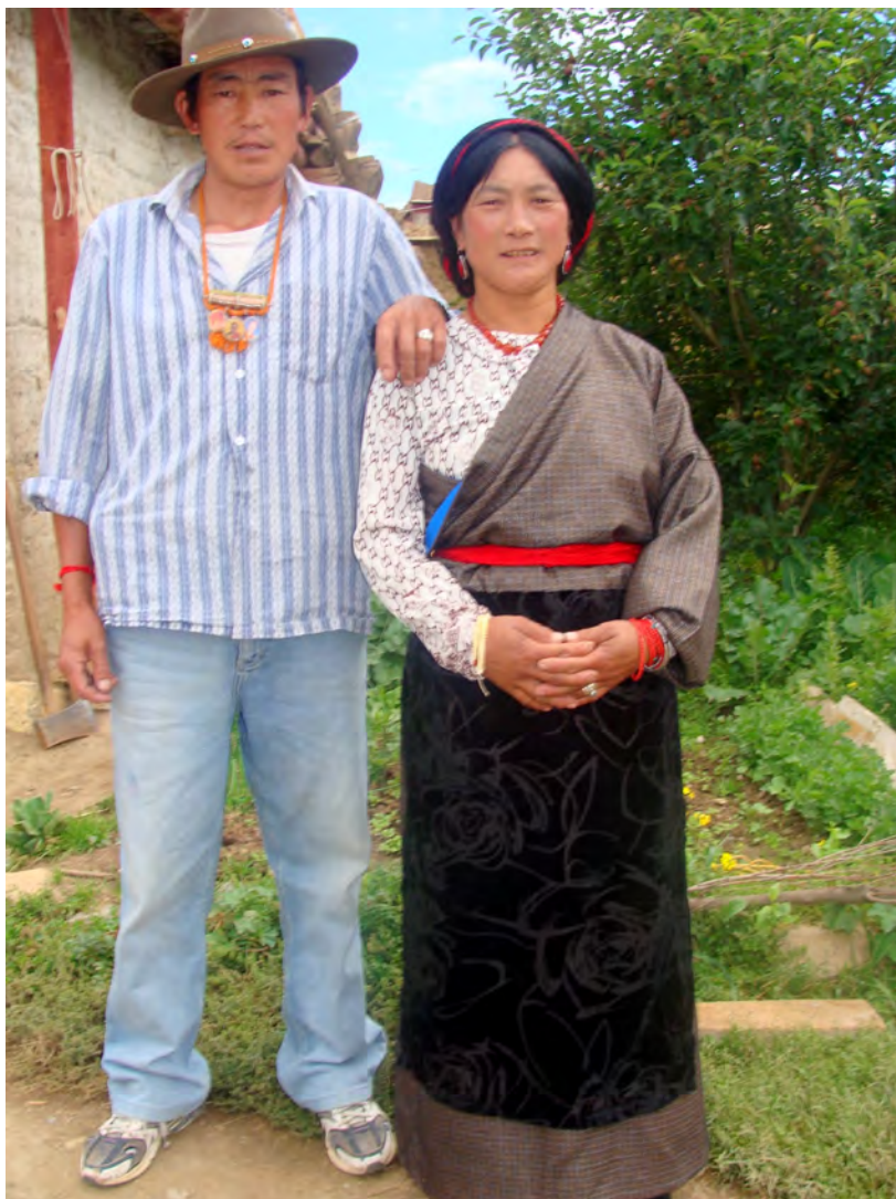
My parents standing in our yard (August 2011, Tshes bcu lha mo).

Bsam 'grub's parents were very angry but, when they knew that our baby was born, they were no longer able to stay away. One morning, when I was collecting yak dung in the stable, somebody called my name. I opened the door, and Bsam 'grub's parents were standing there, looking guilty. I politely greeted them. When they saw their first grandchild, they forgave Bsam 'grub and me.