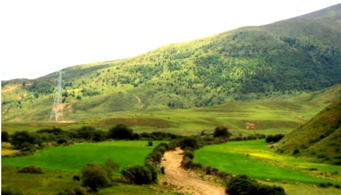
The track from Nor bu khug Village to the local herding place (June 2013, Dbang mo).

Four yaks had disappeared like magic, and we didn't find any trace or evidence to suggest who the culprits were. Those thieves were cruel and selfish.