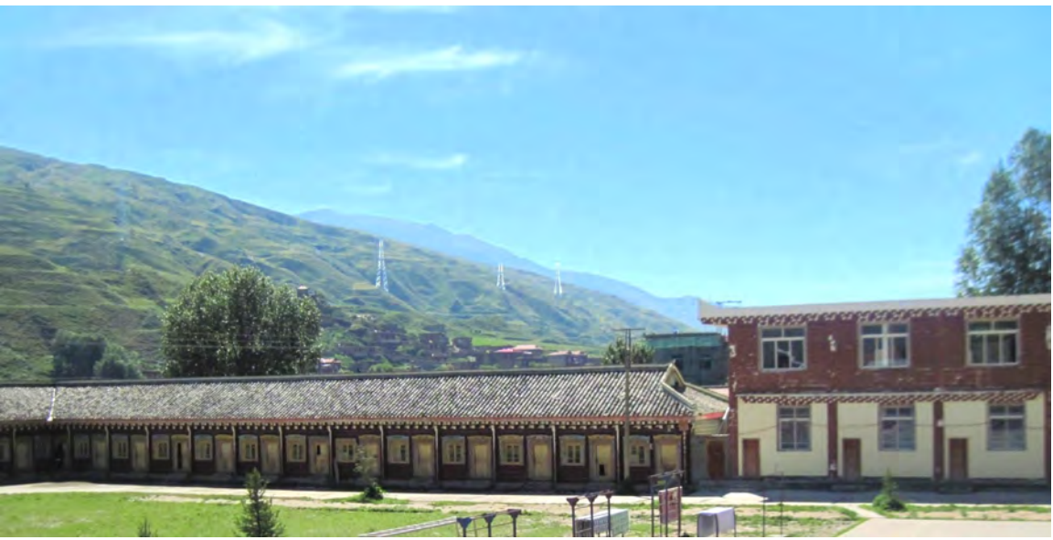
The Tibetan Middle School in Tre hor Town, Brag 'go County (15 June 2013,).